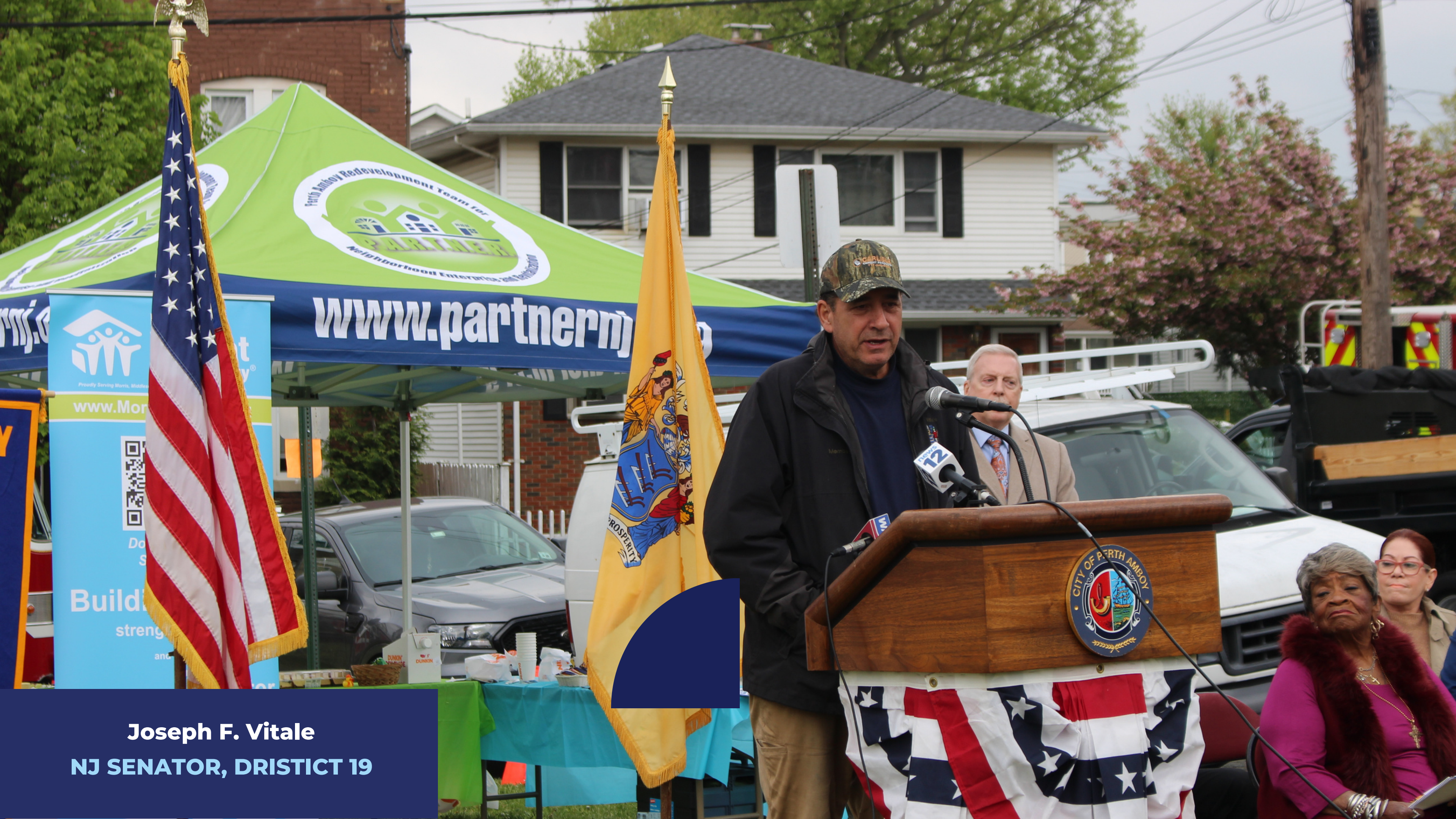
Joseph F. Vitale NJ SENATOR, DRISTICT 19